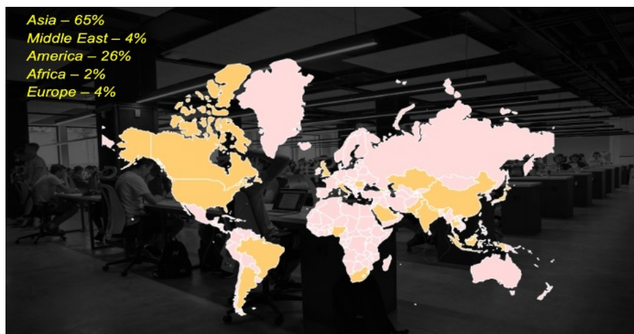
Figure 2. Map showing the regions (in yellow) from where the responses were received

agree to promote the post and to encourage teachers to act as the seed to distribute the internet survey to their network; (d) the groups/pages shall be from different parts of the world.